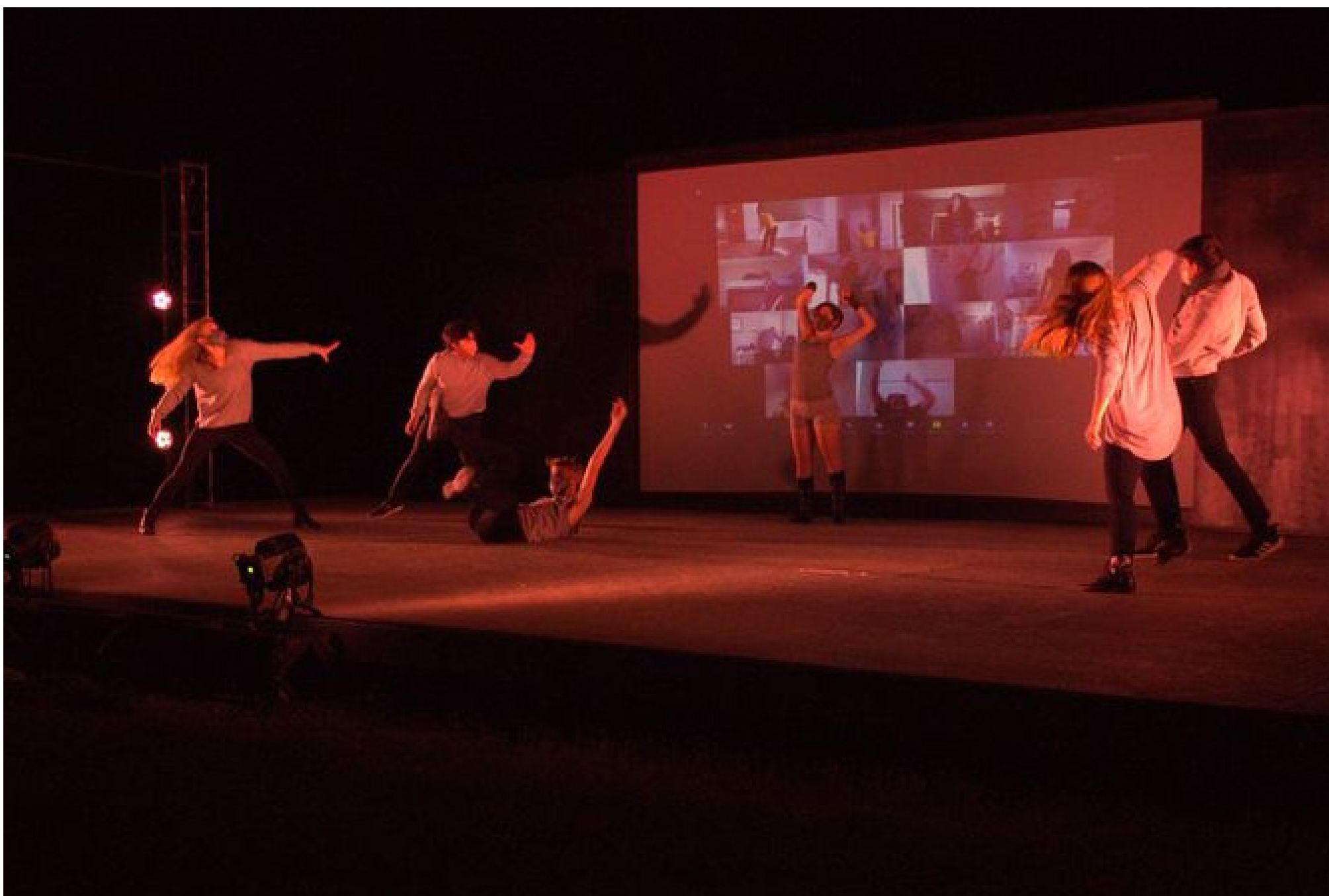
Everybody performance on the outdoor theatre space. Used of movement involved with projections to create and represent connectivity