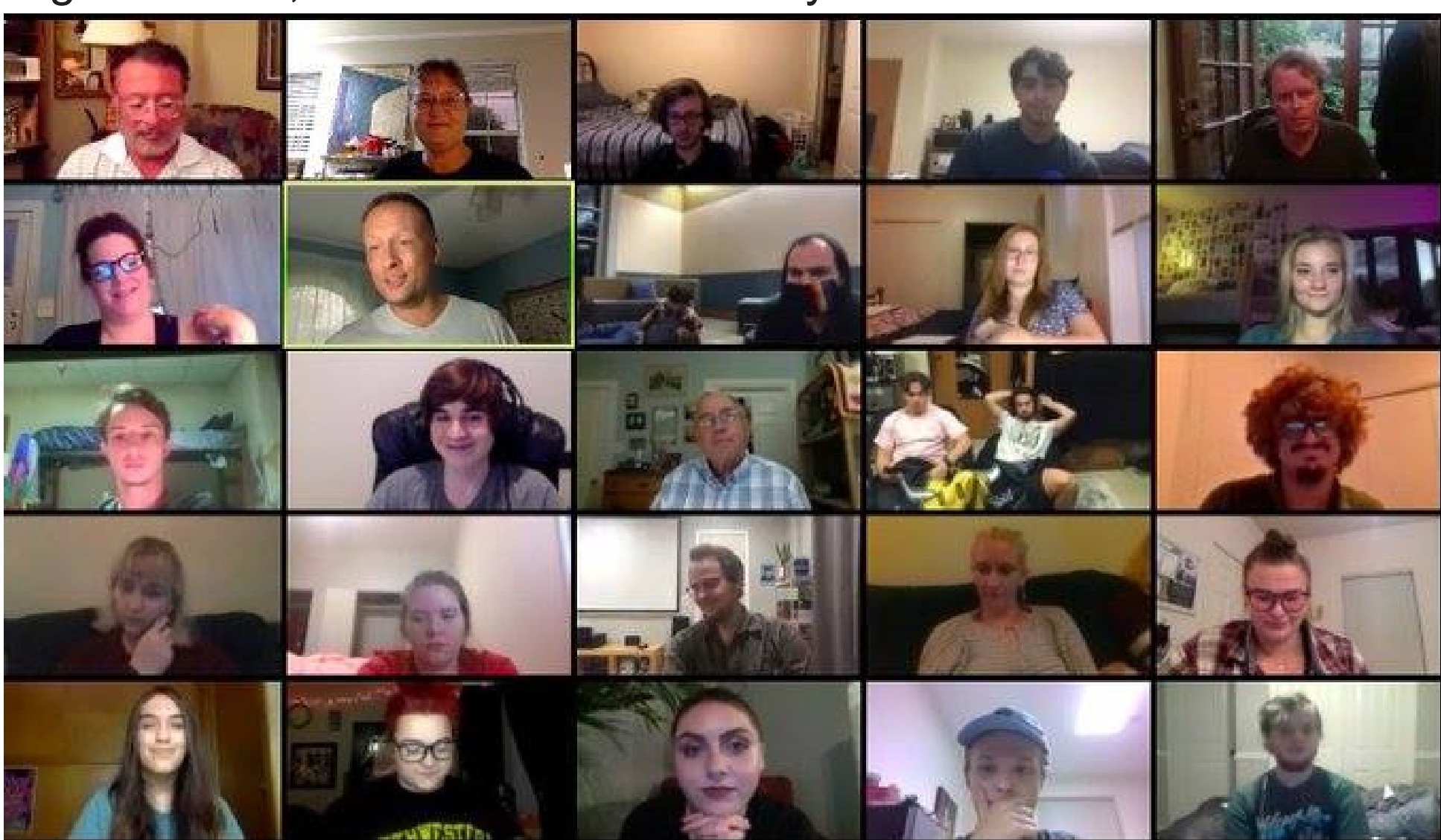
Weekly theatre company meeting with students and faculty including staff and administration during Fall 2020

Theatre has taken a financial loss, but has shown that it is an important part of the community as a place to forget about the stress of life and enjoy some entertainment.