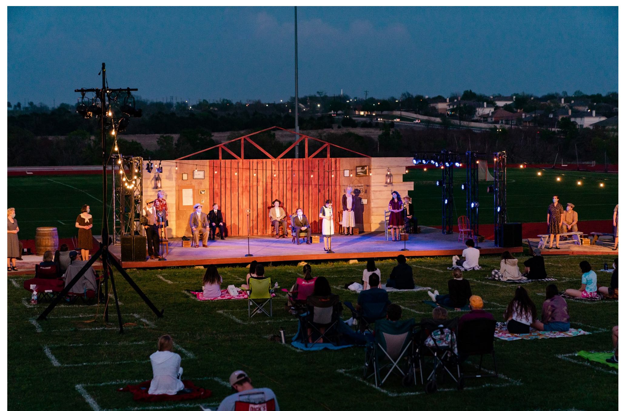
Bright Star: Concert Version with a socially distanced audience. Singers are ten feet apart.

To celebrate the tenacity of the theatre program to provide top quality training with extremely stringent safety protocols.